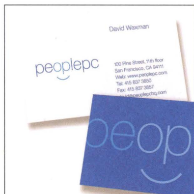
Best of Show People PC Identity System Landor and Associates